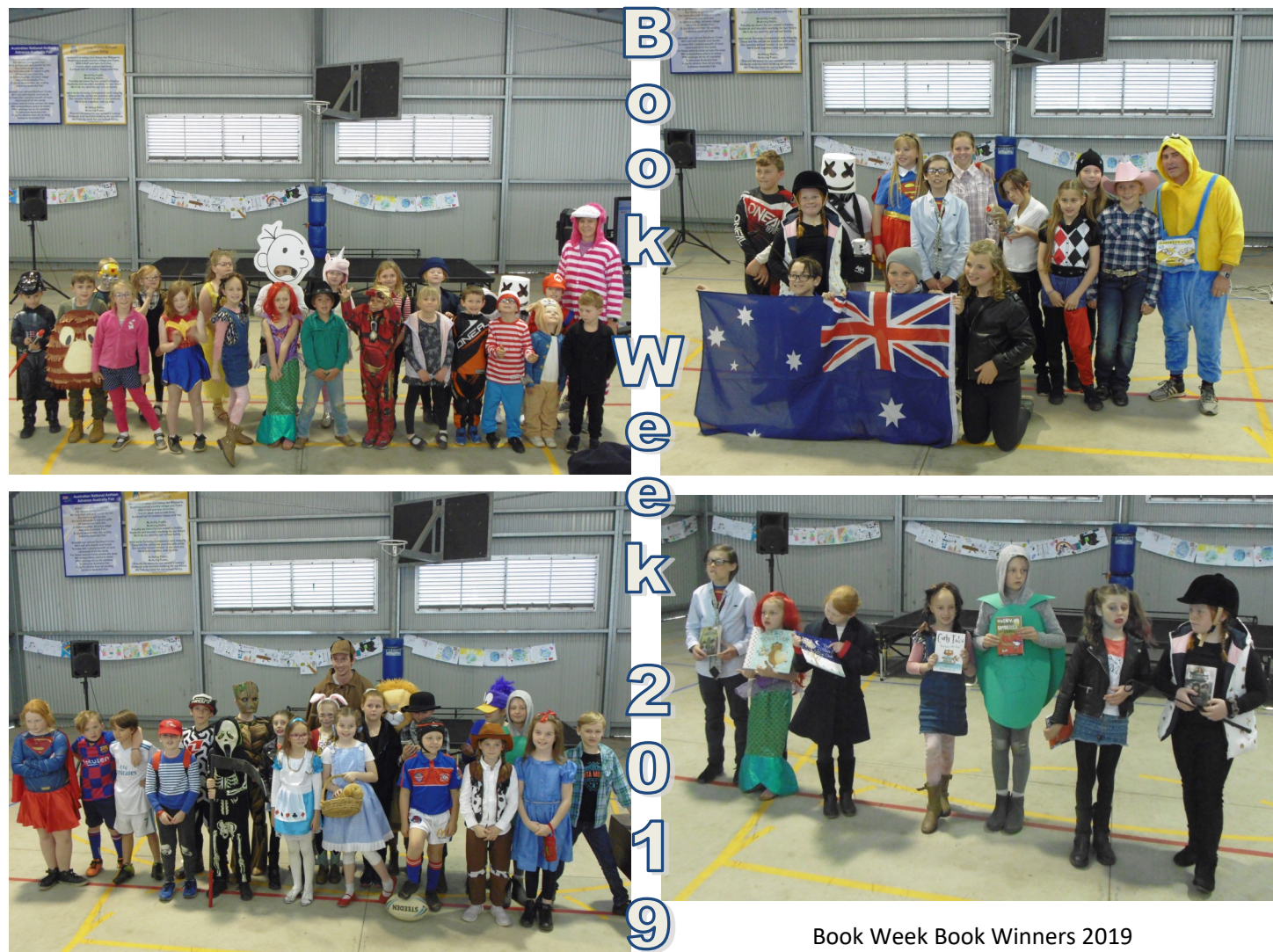
Book Week Book Winners 2019