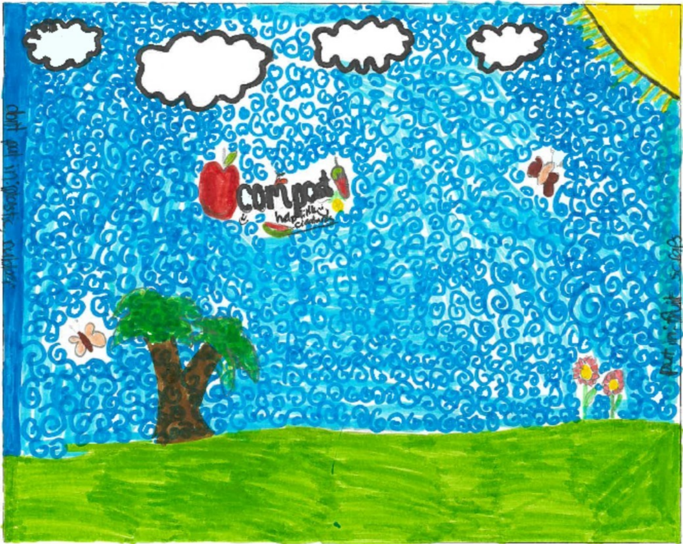
A huge congratulations to Matylda for winning the classroom caddy competition. This winning picture will be displayed on the recycling caddies in each classroom.