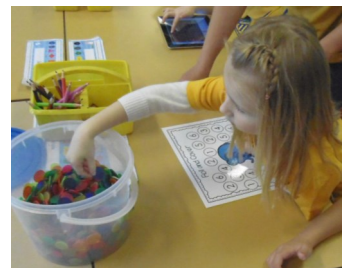
Grace matching numbers