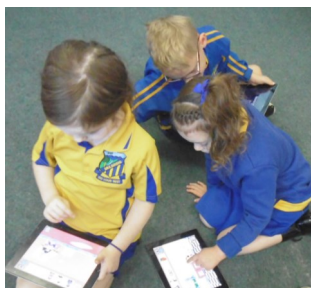
Lilly had some big helpers while she was working on the iPads too